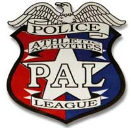
Mount Olive PAL