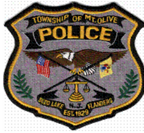
Mount Olive Police Department