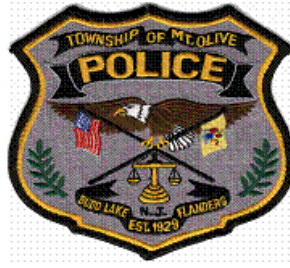
Mount Olive Police Department